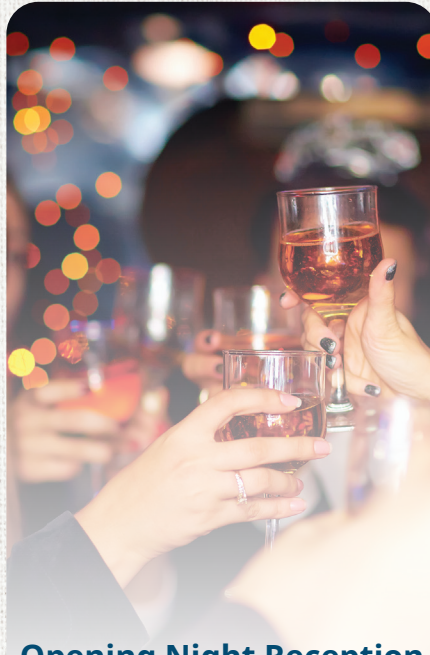
Opening Night Reception