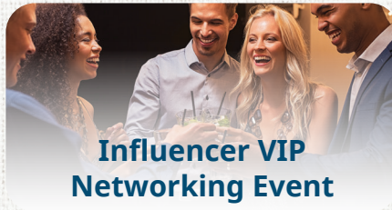
Influencer VIP Networking Event