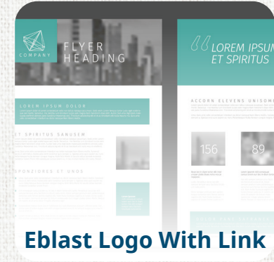
Eblast Logo With Link