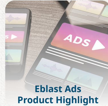
Eblast Ads Product Highlight