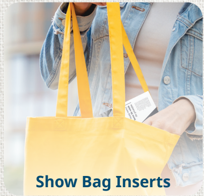
Show Bag Inserts