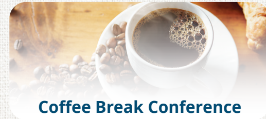
Coffee Break Conference