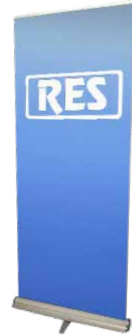
RETRACTING BANNER STAND 31.5" x 82" $425.00 - single sided