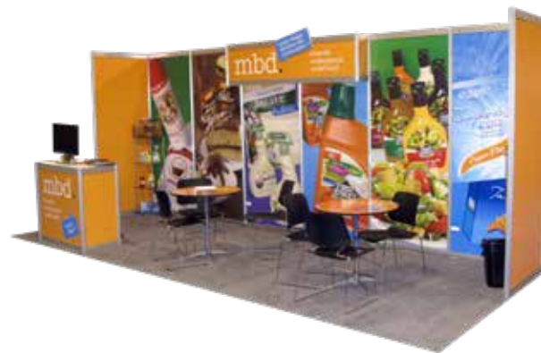
BACKWALL GRAPHICS (call for a quote)