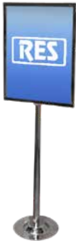
CHROME SIGN HOLDER WITH 22" x 28" SIGN $175.00 - single sided $225.00 - double sided

Leave a lasting impression with quality graphics from our graphics department. Our state-of-the-art sign shop can create anything from meter boards to banner stands that will help your booth stand out. All custom graphics include, production and delivery to your booth.