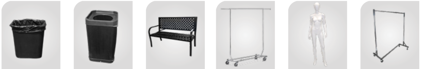
Dimensions: 18" wide 18" deep 32" height